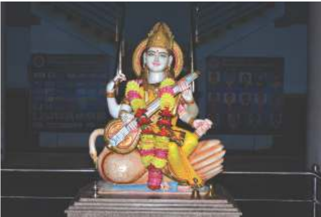
Divinity of College